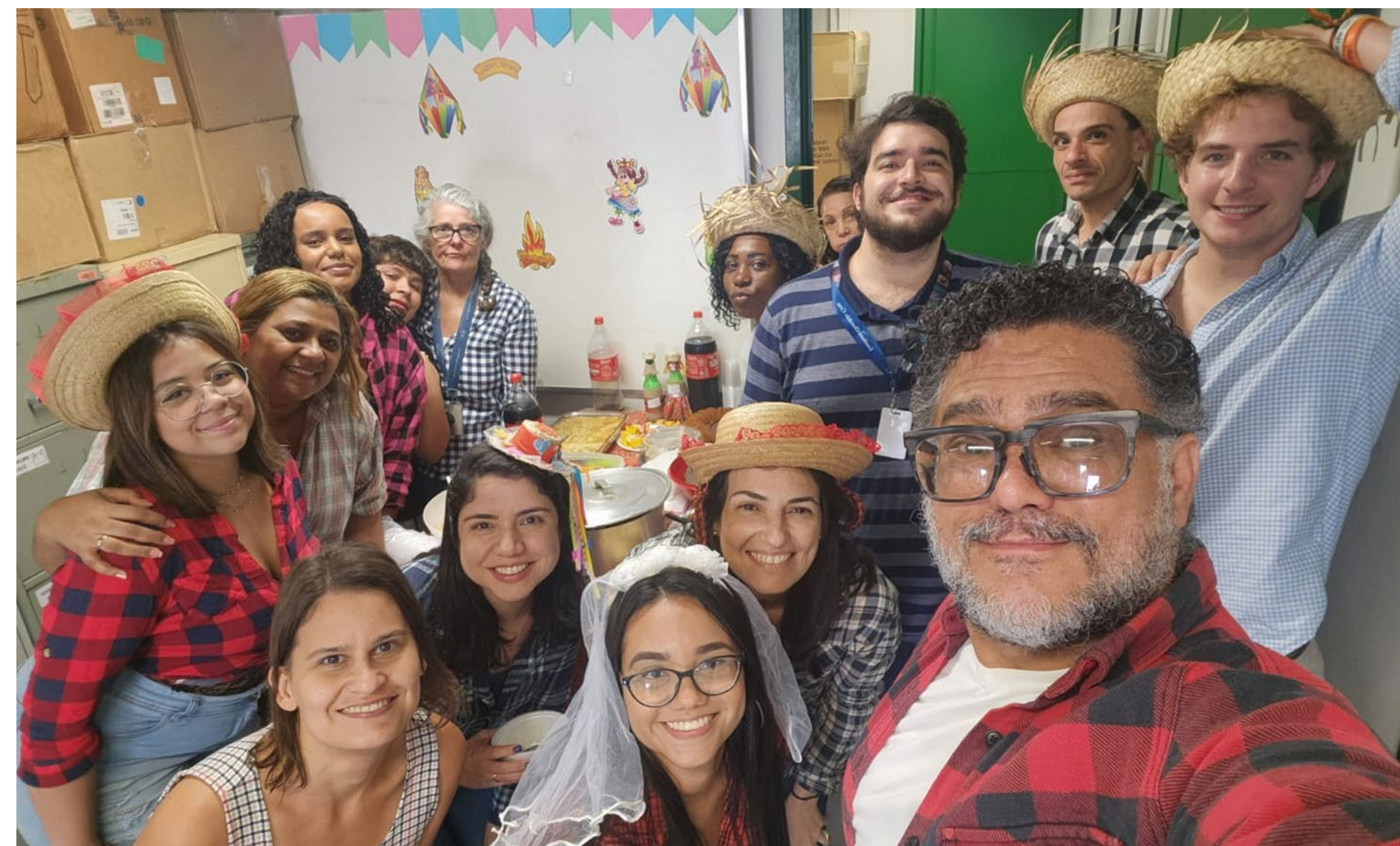
Image of all of the Viral Hepatitis Clinic staff at the Oswaldo Cruz Institute