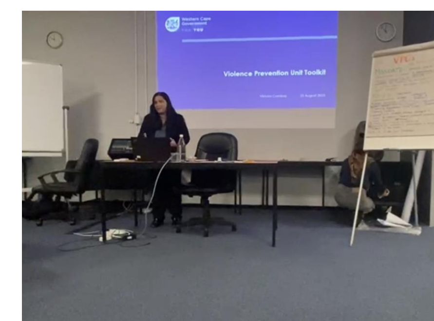
Still from the VPU Toolkit presentation led by me on the third and final day of the VP Coordinator Workshop at the DCC.