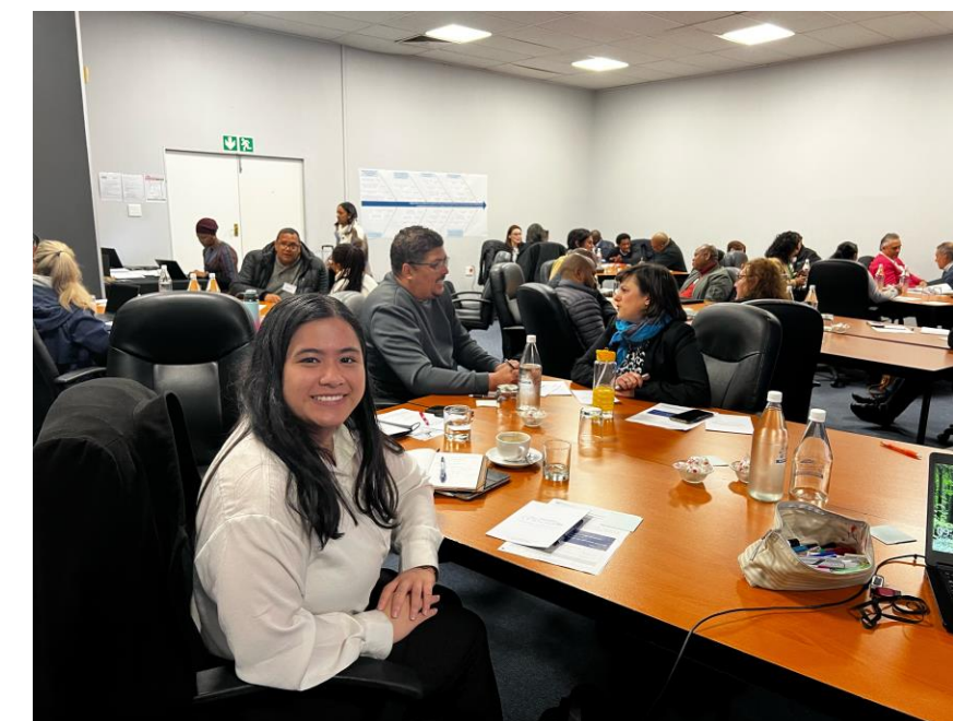
The first day of the 3-Day VP Coordinators Workshop at the Durbanville Conference Center, showing posters of the VPU approach.